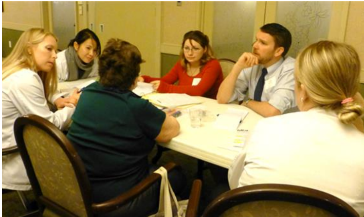
GAIT student team reviews records and interviews host site resident