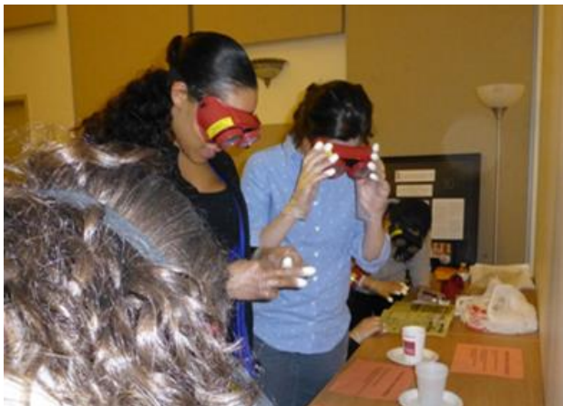
GAIT students experience Activities of Daily Living with simulated visual and fine motor impairments