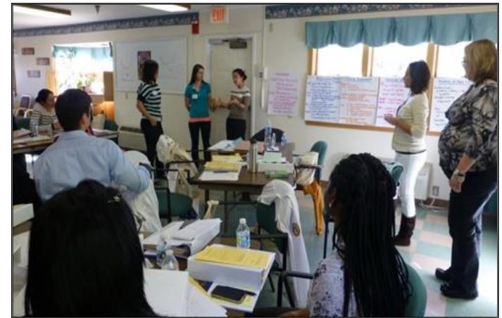
GAIT student teams present and discuss interprofessional assessment with host site staff