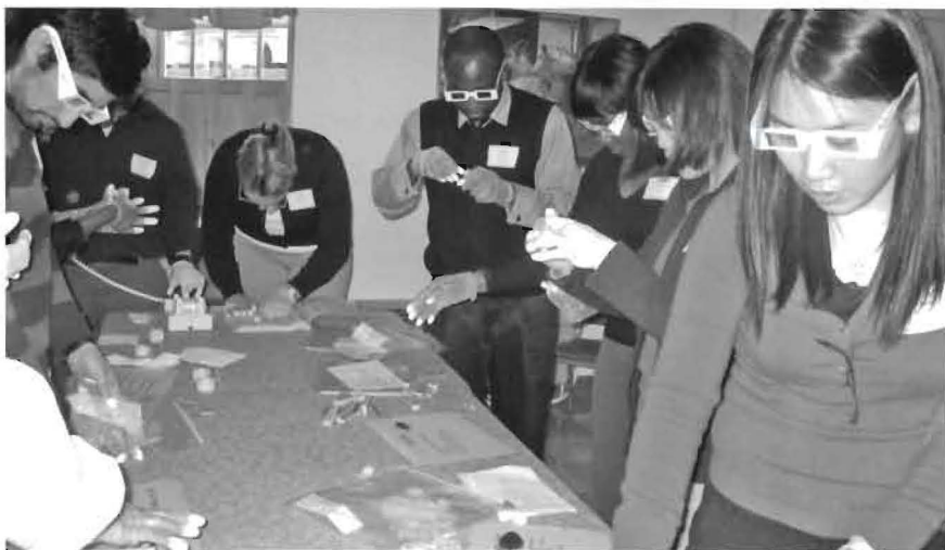
An aging simulation activity engages GAIT students in the challenges elderly people face in their activities of daily living.

In FY2008, thirty-three health professions students representing Dentistry, Medicine, Nursing, Occupational Therapy, Pharmacy, Physical Therapy, and Social Work, from University of Maryland Baltimore (Dental, Medicine, Nursing, and Pharmacy schools),