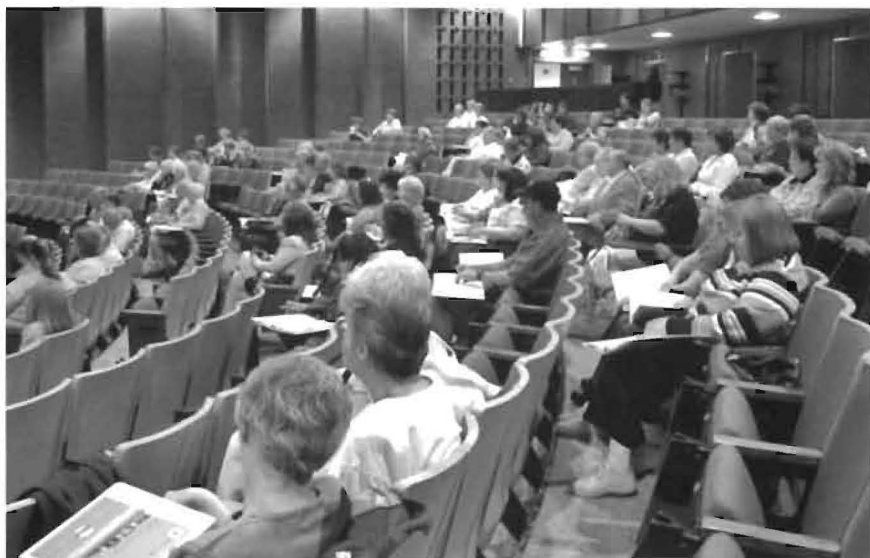
Fourth annual Western Maryland Mini-Med School class.

commonly experienced by citizens of Western Maryland. Courses were taught by medical professionals from the local community and from the faculty of the University of Maryland School of Medicine. Mini-Med was a partnership effort of WMAHEC; the University of Maryland School of Medicine; the University of Maryland Statewide