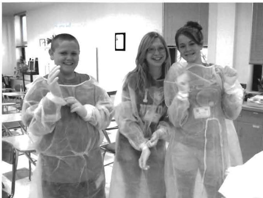
Middle School students participate in the Health Careers segment of the week-long STEM Career Exploration Camp.

professional; 18 Field Trips in which 544 students participated; 3 STEM Family nights which involved 152 students and parents; 15 STEM Professional Classroom visits which engaged 1061 students in the opportunity to