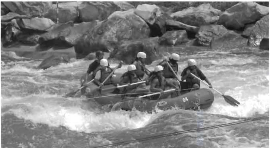
ECHO students participate in an exciting team building activity at the world's only mountaintop whitewater course, located at Adventure Sports Center International in Garrett County.