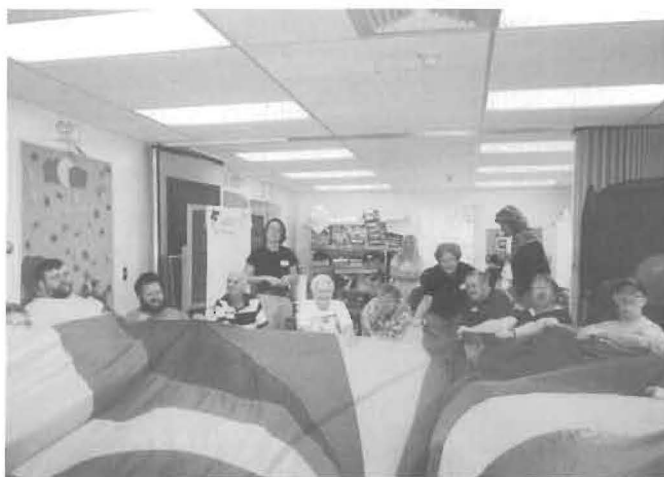
Georges Creek Adult Day Care Center clients, aged 21-91, participate in a parachute exercise led by an Interdisciplinary Prevention in Rural Communities team. The center is located in Lonaconing, Maryland.

"I now understand the meaning of the great disparity between urban and rural access to health care and the issues that create this disparity. I have also seen how a dedicated community truly works around barriers to provide what is needed."