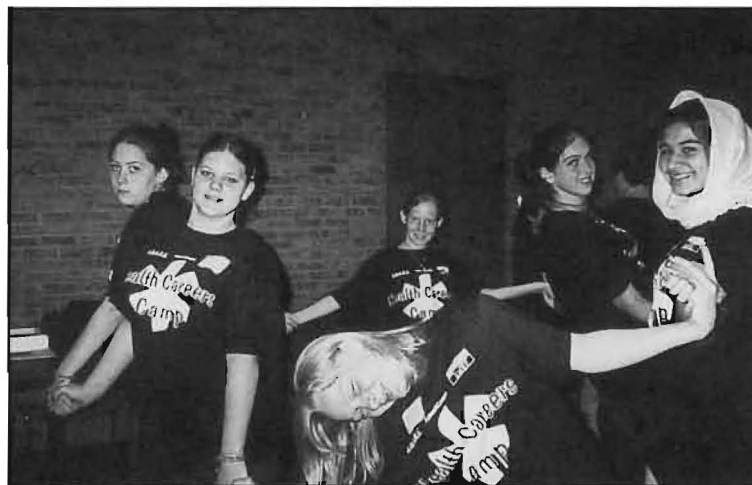
S.H.A.R.E. students practice teambuilding skills at the summer camp held in June.