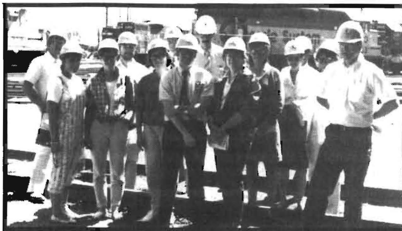
New AHEC students receiving an introduction to CSX Locomotive servicing as part of an orientation to the locality, the people and types of employment.