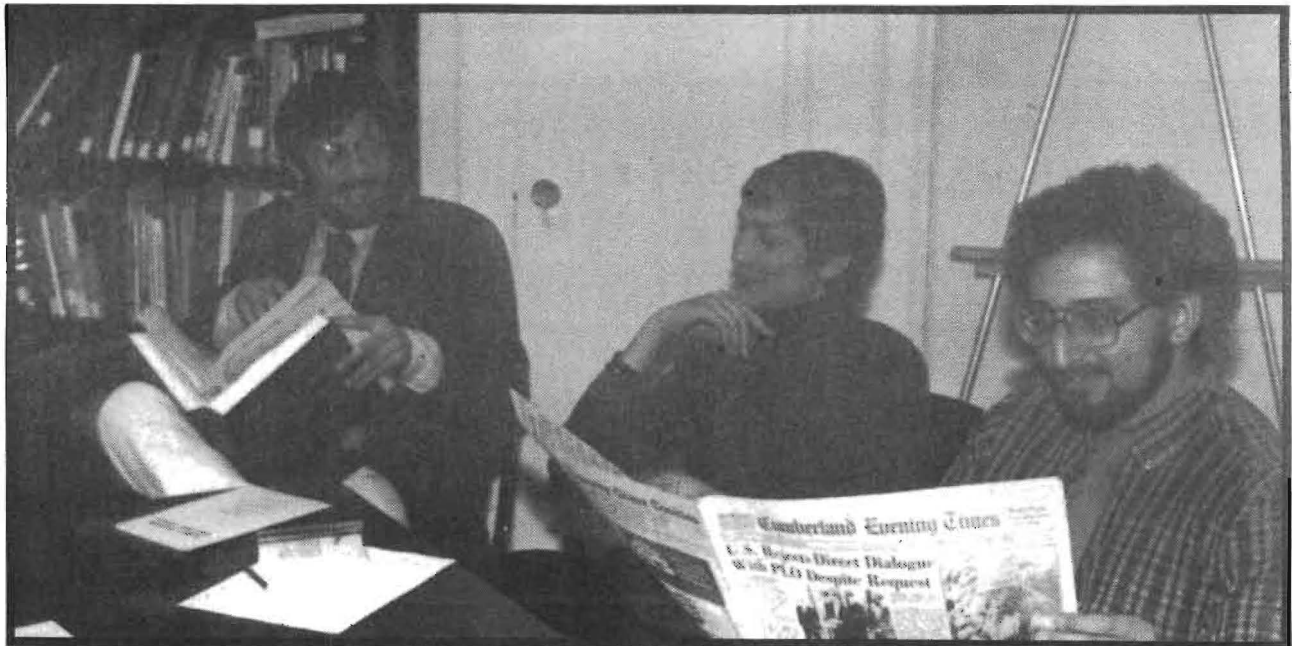
Students participating in our local preceptorship program make use of the CAHEC library for leisure and professional reading.