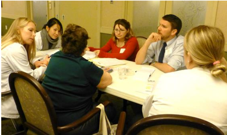
GAIT student team reviews records and interviews host site resident